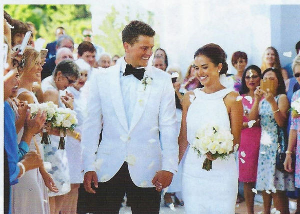
These gorgeous florals were created by Suzan Sickling